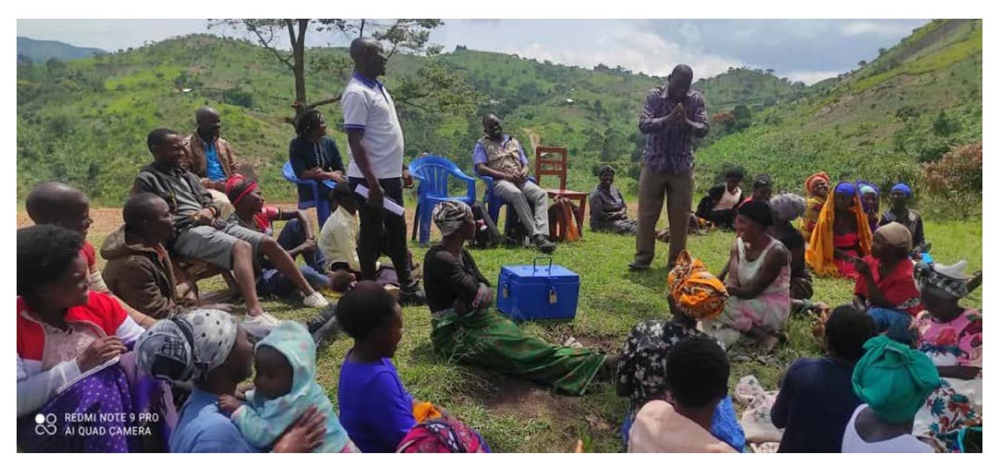
FAWE Uganda field staff and the community resource persons introducing the purpose of the baseline assessment to the community members in Ntoroko District

FAWE Uganda carried out a baseline assessment of the skillful parenting model under the "Community Action" to End Violence Against Children" in the Rwenzori sub-region project on 12th - 16th September 2022.