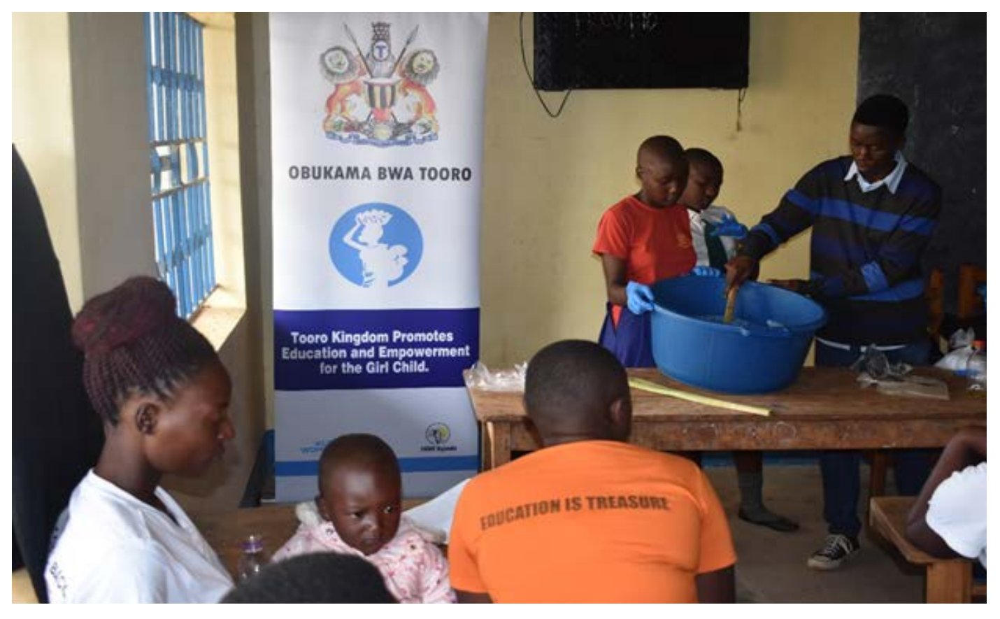
Girls trying out liquid soap making during the training from Kyenjojo district

FAWE Uganda carried out awareness training for the PRO-SEVU project beneficiaries, parents and other vulnerable girls from the eight districts of Tooro Kingdom to address the challenges associated with ASRHR and menstrual hygiene on 24^{th} – 29^{th} August 2022. The trainings were facilitated by the Kingdom representatives, community development officers, health assistants and the trainers of sanitary pads making and liquid soap making.