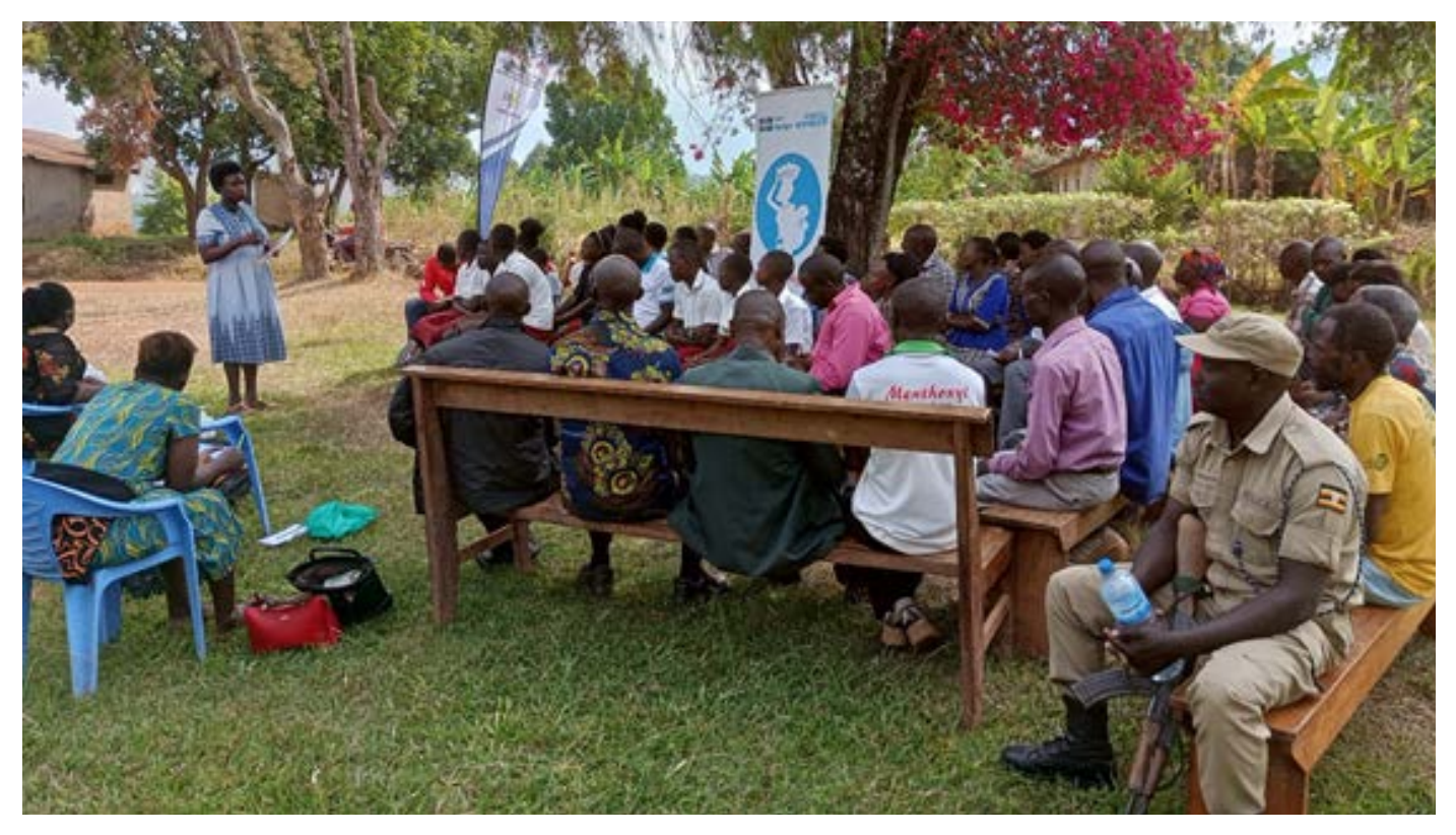
Representative from Kogere Foundation making a presentation during the Community Dialogue Meeting in Kiboha Parish Mugusu Town Council, Kabarole District

FAWE Uganda carried out community dialogue meetings in Kabarole, Kyenjojo, Fortportal City, Ntoroko, Bunyangabu, Kyegegwa, Kamwenge and Kitagwenda districts from 25<sup>th</sup> July 2022 to 5<sup>th</sup> August 2022. The dialogues were carried out by FAWE Uganda staff, facilitated by district officials, Tooro Kingdom officials and the community action platform committees.