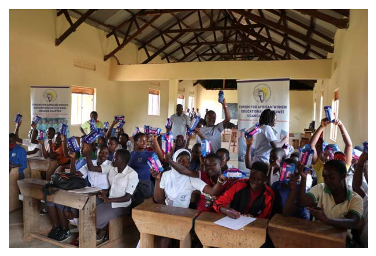
Girls at Byerima Primary School Kyankwanzi District after receiving re-useable pads on 15th July 2022

FAWE Uganda partnered with a local CBO called Hope Awareness and Literacy Club (HALC) to create awareness on Menstrual Hygiene Management and donate re-usable sanitary pads to schools in Kyankwanzi district on 14<sup>th</sup> – 15<sup>th</sup> July 2022. With a team comprising of alumni, staff and Hope Awareness and Literacy Club members, menstrual hygiene awareness was carried out in 3 schools (2 secondary and 1 primary), distributed reusables sanitary AfriPads, knickers, menstrual hygiene management training manuals and guidelines on the roles and responsibilities of senior women and men teachers.