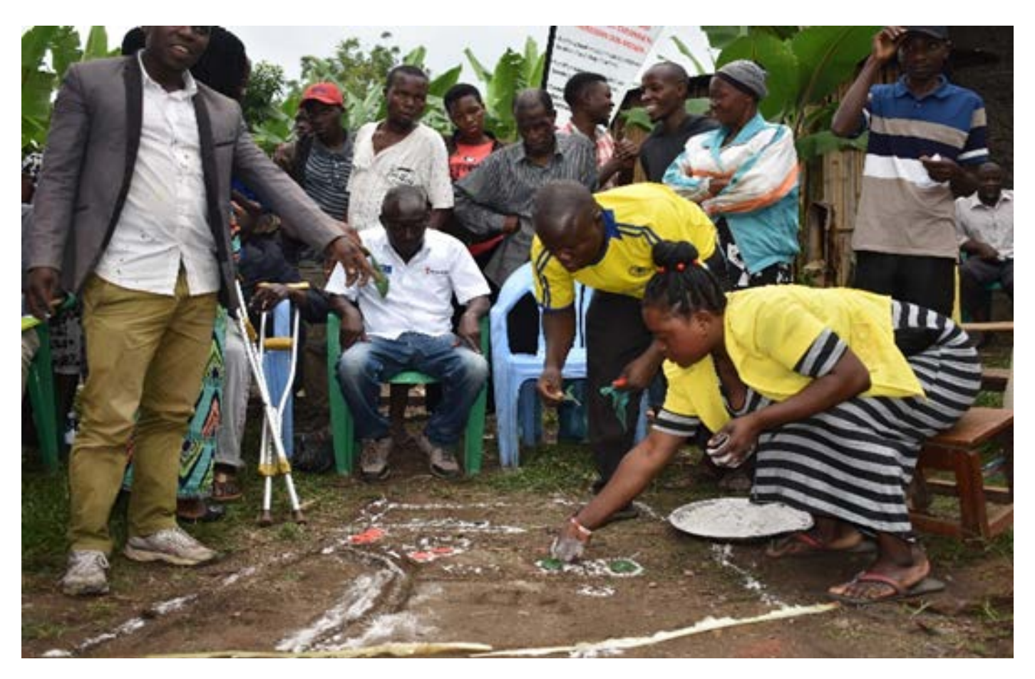
Community members in Kirindi Village, Bundibugyo district; drawing a social and resource map during a field practicum on 26<sup>th</sup> July 2022

FAWE Uganda conducted a training of trainers for 10 FAWE Uganda staff and 15 district disaster committees of Bundibugyo, Ntoroko and Kasese on Community Managed Disaster Risk Reduction (CMDRR). The 7 day training took place from 25<sup>th</sup> to 30<sup>th</sup> July 2022 and the participants included the chairpersons District Disaster Committees, Senior Agricultural Officer, District Community Development Officer, District Communications Officer, Senior Community Development Officers and the District Statistician.