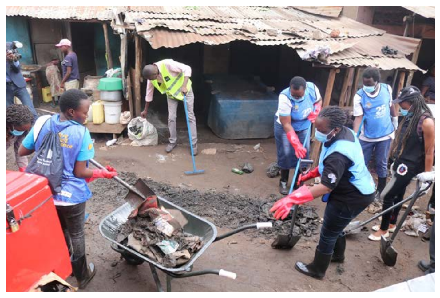
FAWE Uganda staff, alumni and well-wishers cleaning in Mulimira Zone, Bukoto Kampala 0n 20th August 2022

As part of the Silver Jubilee celebration, FAWE Uganda held a community outreach on 20<sup>th</sup> August 2022 in Mulimira Zone, Bukoto, Kampala to extend solidarity with the community and carried out a number of activities including general cleaning, donation of assorted items, raising awareness and rallying parents to support children to stay in school and complete their education. The local leadership including the Division Mayor, KCCA Employees, Councilors and the Local Council I and II committees) accepted to partner with FAWE Uganda to carry out the cleaning exercise as well as sensitisation of the community on issues of hygiene, environmental health, child protection and the need to support girls access, remain and complete their education.