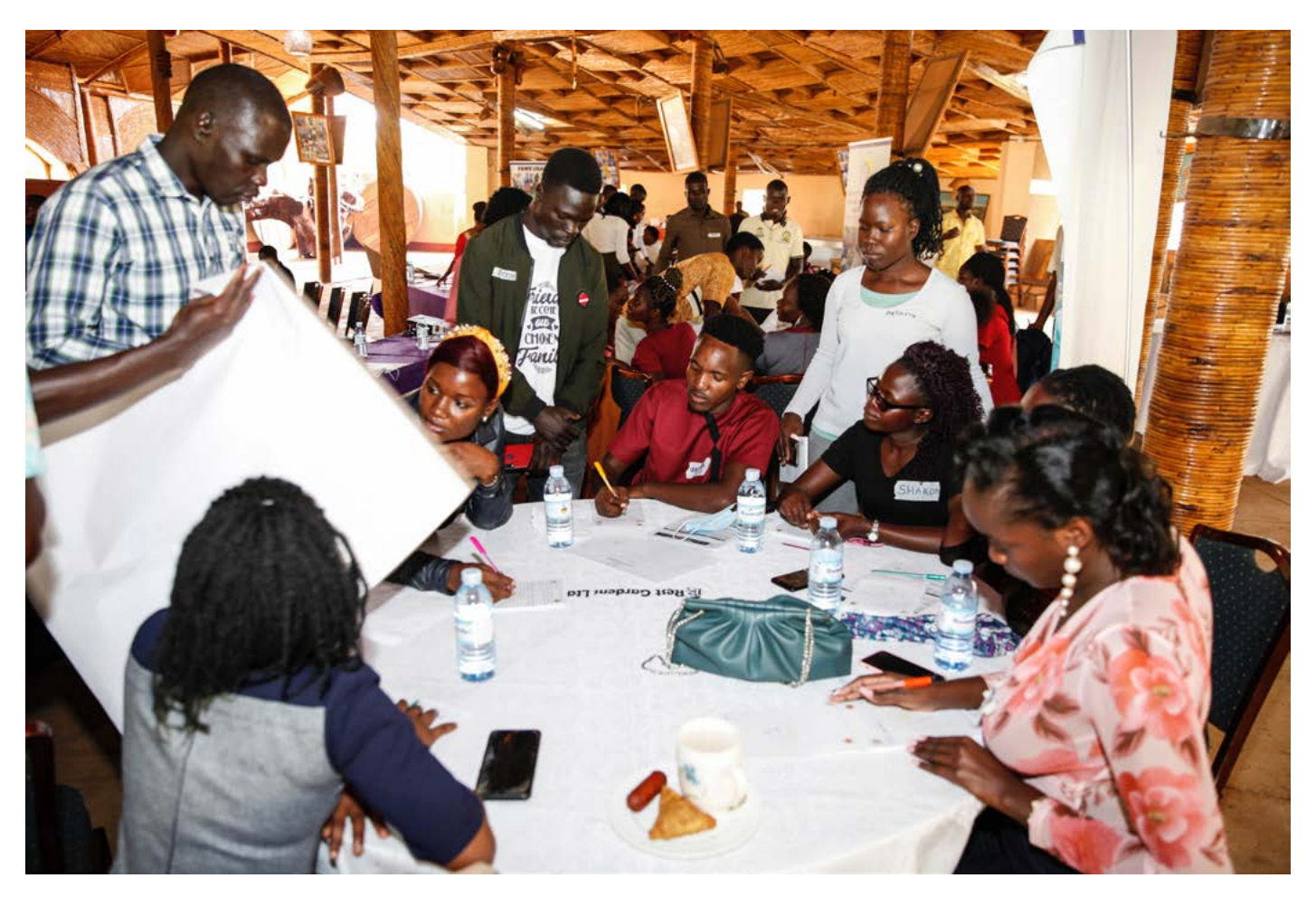
FAWE Uganda Mastercard Foundation Alumni carry out a group assignment at the school to work readiness workshop at Rest Gardens Bweyogerere

FAWE Uganda carried out the school-to-work transition workshop for the FAWE Uganda Mastercard alumni and students to prepare and equip them with skills to effectively compete in the area of work and labour market. The workshop was facilitated by Strategic Engagement, an HR Consult from Tuesday 6<sup>th</sup>-Friday 9<sup>th</sup> Sept 2022 at Rest Gardens in Bweyogerere. A total of 76 (44 Female and 32 Male) recently graduated students participated in the training.